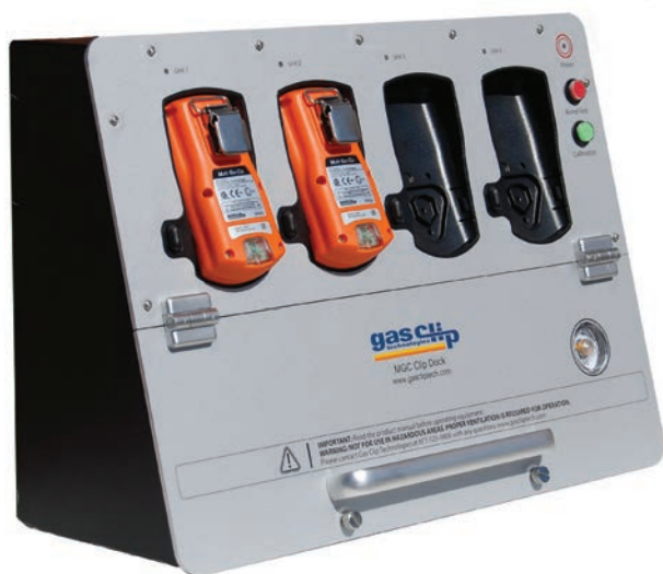
MGC Wall Mount Dock