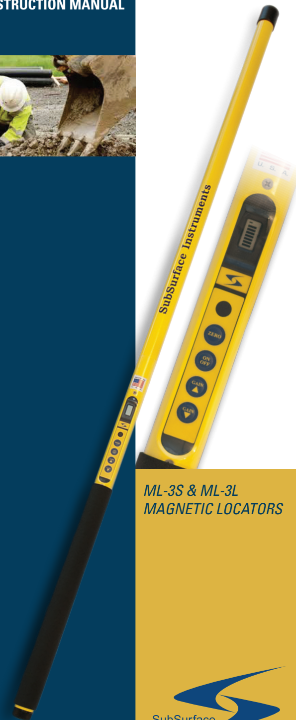
ML-3S & ML-3L MAGNETIC LOCATORS